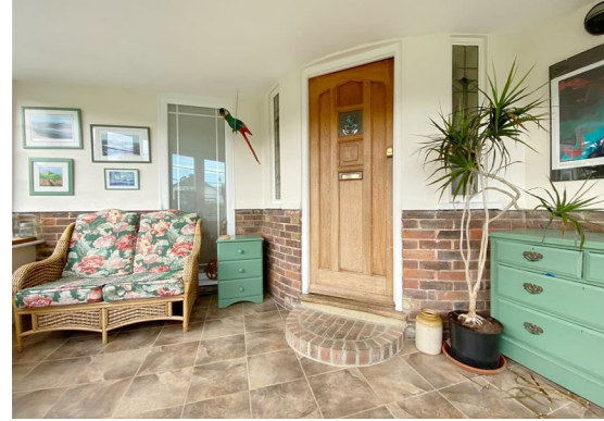
Bay Fronted South Facing Lounge 15'9 x 16' (4.80m x 4.88m)